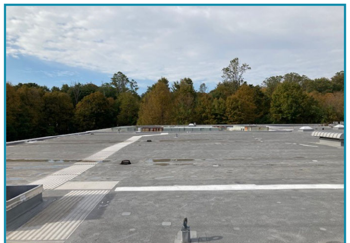
Burr Full Roof Replacement

Approved by the Board of Education On October 27 th , 2020 Updated: January 11, 2021