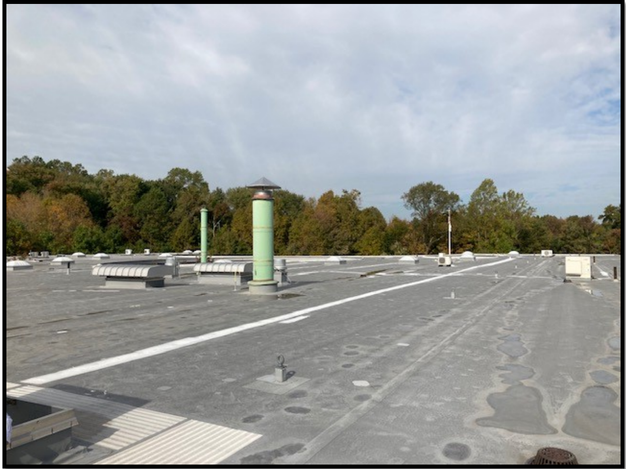
Burr Elementary School – Full Roof Replacement