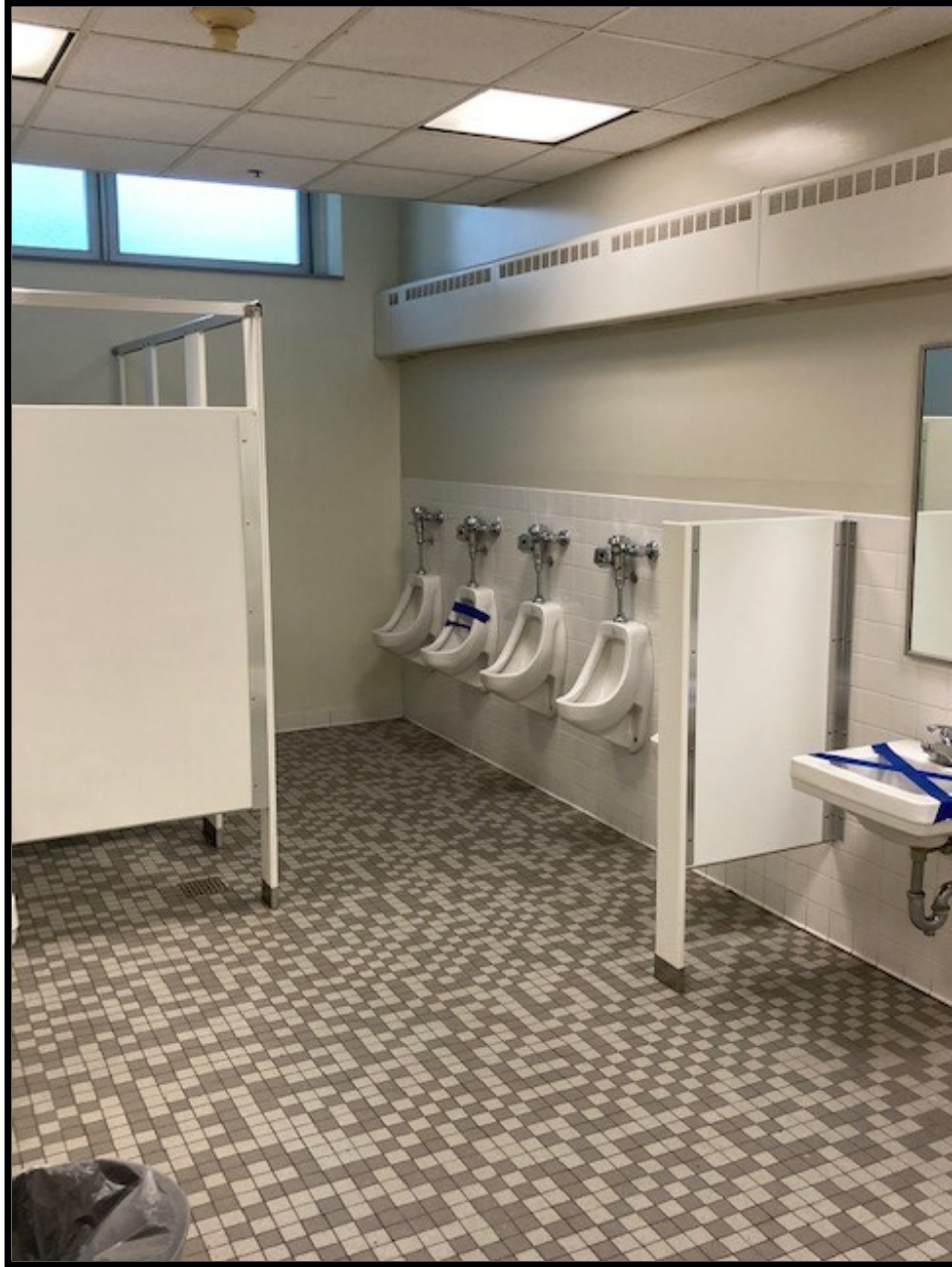
Fairfield Ludlowe High School – Student Bathroom Renovation