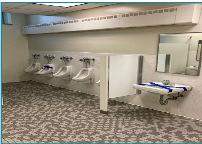
Fairfield Ludlowe High School Student Bathroom Renovation